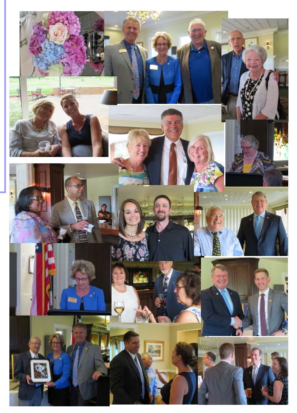
It was a great evening!